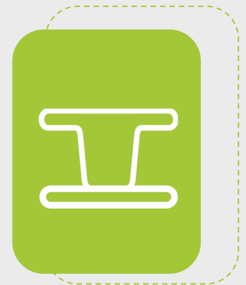
Waterproof plate or tray to set the egg cups on